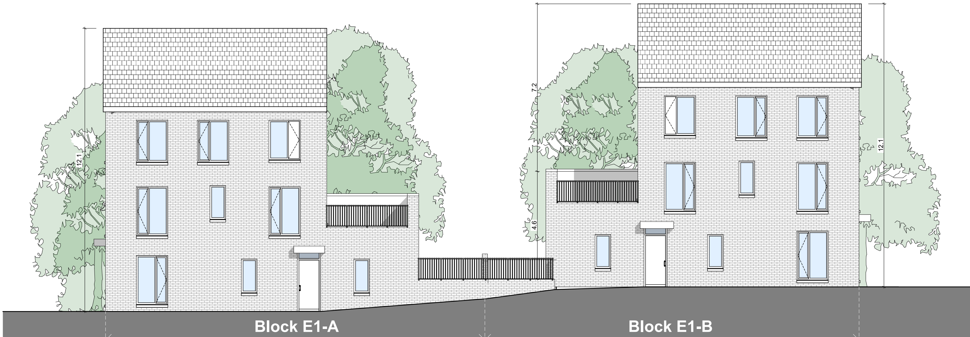
West Elevation SCALE 1:100