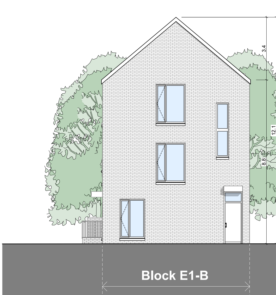
South Elevation SCALE 1:100