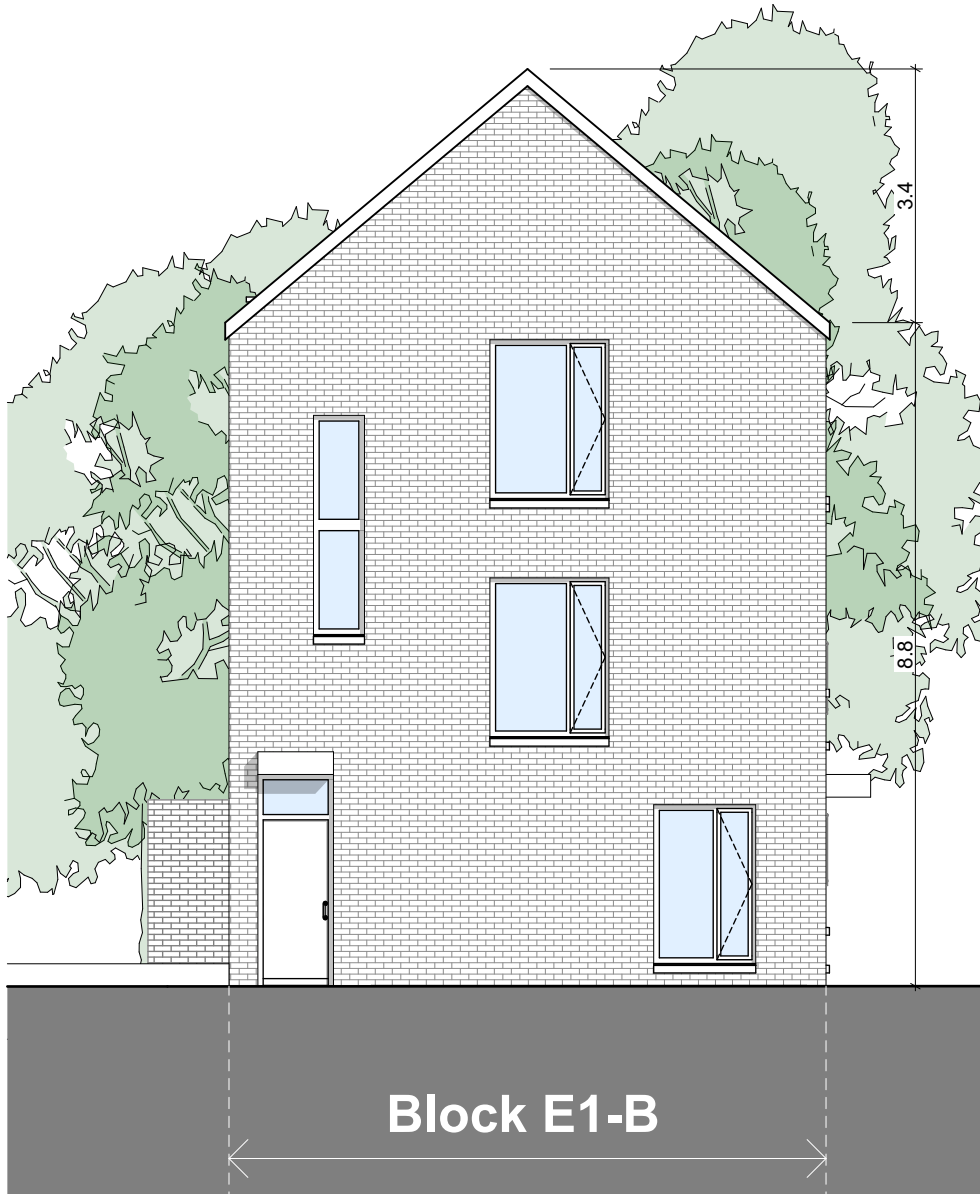
North Elevation SCALE 1:100